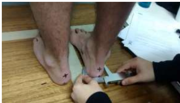
Figure 1. Anthropometric evaluation.

The participants were made to stand on a level table in an upright relaxed two-footed standing position with both feet 10 cm apart. The location of the feet was controlled with lines drawn on the evaluation table. The evaluator marked the anatomic point determined by the underface of the tuberosity of the navicular bone (Fig. 1).