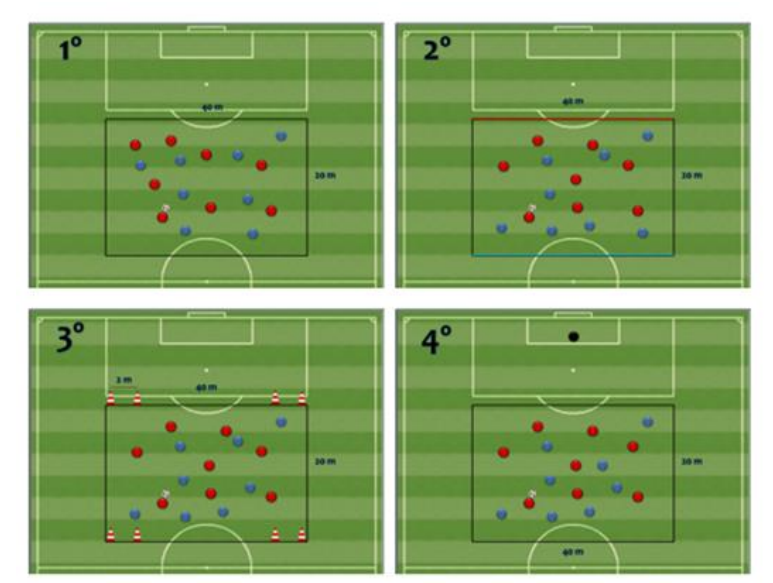
Figure 2 Graphic representation of the four small-sided games formats

The SSGs were carried out on a previously marked pitch, with dimensions of 20 metres wide and 40 metres long. Each small-sided game was played twice, with full possession in the attack phase for each team. Therefore, each time the defending team regained possession of the ball, they returned possession to the attacking team. Following the recommendations of Mallo (2013) and Verheijen (2014) each of the repetitions had a total duration of five minutes and between each of the series, a break of two minutes was taken.