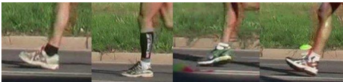
Figure 1. Foot strike type and inversion of the foot. From left to right: Rearfoot strike, midfoot strike, forefoot strike, and inversion.