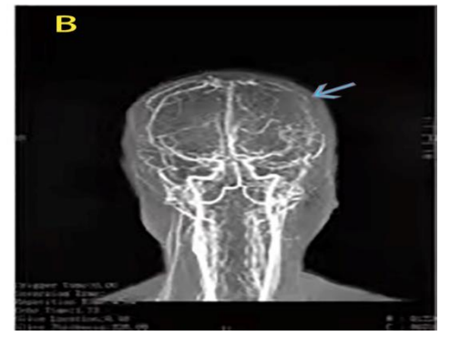
Figure 4. The follow-up results of brain MRI + MRV in 2 months of post-operation.

A) Thrombosis signals (arrow) in superior sagittal sinus, sinus confluence. B) right transverse sinus and sigmoid sinus showed filling defect(arrow).